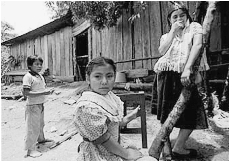
3. Three children playing in La Realidad, one of the Zapatista Autonomous Communities in Chiapas, Mexico, March 2001.