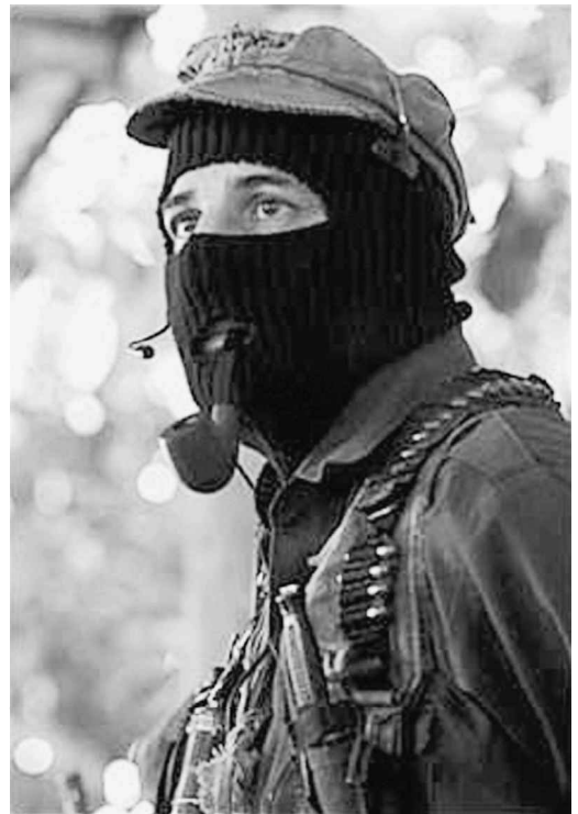
1. Subcomandante Marcos smoking his famous pipe in Mexico City, D.F., March 2001.